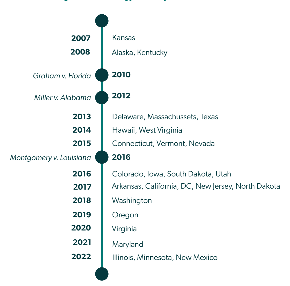
Figure 1. Chronology of State JLWOP Bans

The Supreme Court's rulings propelled a growing number of states to ban JLWOP sentences altogether, reflecting a significant shift in precedent and interpretation of the Eighth Amendment's protection against cruel and unusual punishments. As depicted in Figure 1, only three states had excluded individuals under 18 from receiving parole-ineligible life sentences when Miller was decided: Alaska, Kansas, and Kentucky. After the Miller ruling, an additional nine states banned JLWOP: Connecticut, Delaware, Hawaii, Massachusetts, Nevada, Texas, Vermont, West Virginia, and Wyoming. After the court's Montgomery v. Louisiana ruling in 2016, an additional 16 states and the District of Columbia banned JLWOP. This brought the total of states that ban LWOP for juveniles to